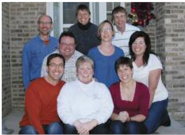
Former 53rd Musicians take a break from practicing for their concert at 53rd Weekend 2011!

From a rich musical history at 53rd Weekend many lasting friendships have been created. This raggedy band of former 53rd Musicians will come together for an evening of song to celebrate 53rd Weekend's 40th birthday. From a cassette recording in 1991 called 'Creative Harmonies' to various leadership roles at 53rd Weekend, some are still involved while life has led others down different paths, but all will re-assemble for a Saturday evening to remember. Past participants may recall some of these faces and look to renew friendships and all participants will enjoy the music 'Creative Harmonies - A Reprise'.